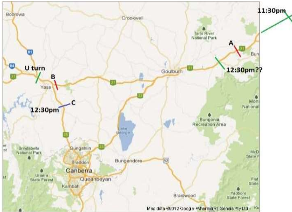
Tuesday 27th November 2012

short time. The map below shows the rough areas where we were taken from point A to point B: