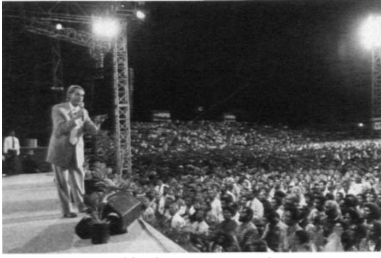
Preaching in Papua New Guinea.