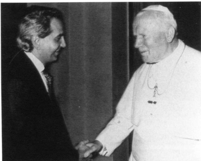
With His Holiness Pope John Paul II.