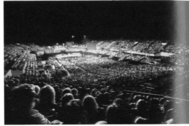
A crusade in Louisville, Kentucky. A typical monthly crusade such as this will draw crowds of up to 20,000 for each service.