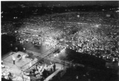
Some of the 500,000 people who attended the crusade in Manila.