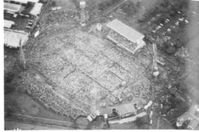
The crowd of 300,000 in Papua New Guinea.