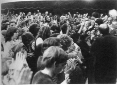
Preaching at a conference on the Holy Spirit in Jerusalem.